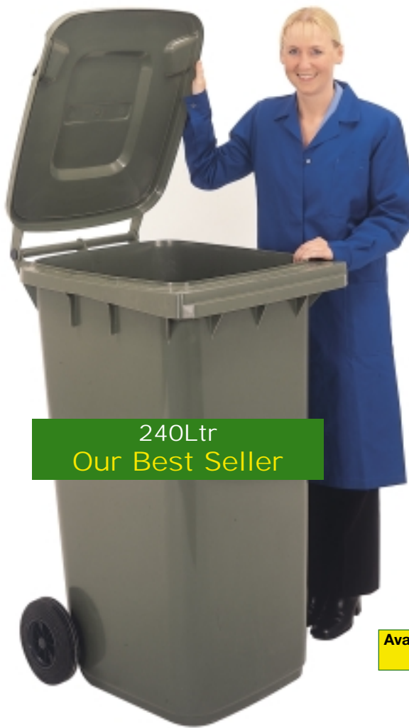
240Ltr Our Best Seller