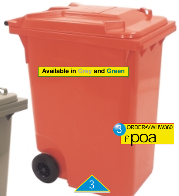
Available in Grey and Green