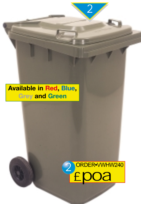
Available in Red, Blue, Grey and Green