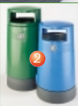
Model 2 - is available in two alternative size options

Colours - Please suffix part number with: R-Red, G-Green, B-Blue or Y-Yellow Please ask about concrete ballast blocks if required - phone our helpline