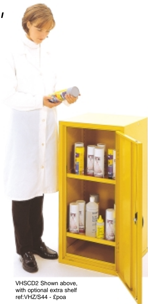
VHSCD2 Shown above, with optional extra shelf ref:VHZ/S44 - £poa