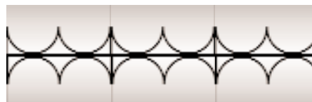
VCS2/6 Side by Side and Back to Back