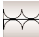
VCS2/2 Back to Back